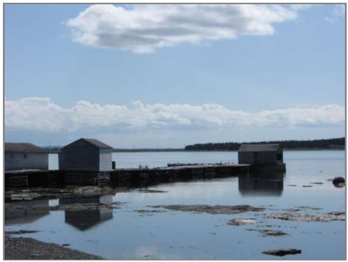
Pynn's wharf and stages