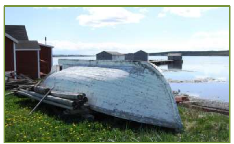
Raleigh Historic Properties and Pynn's Wharf