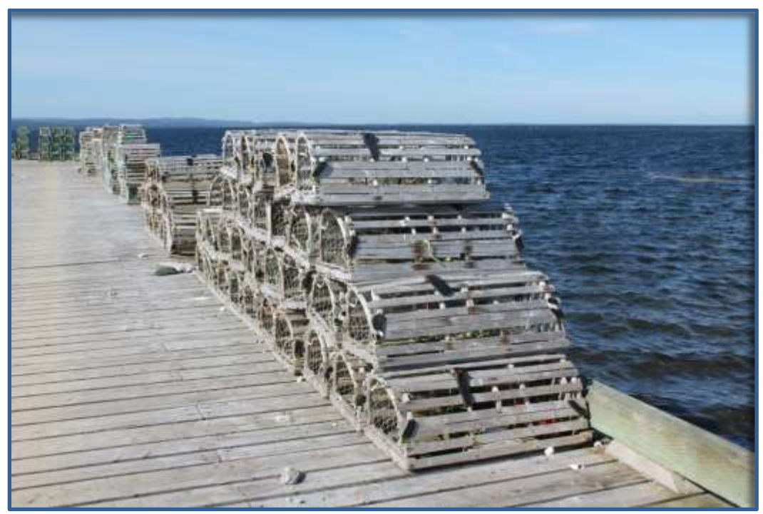
Lobster pots at the wharf in Raleigh.