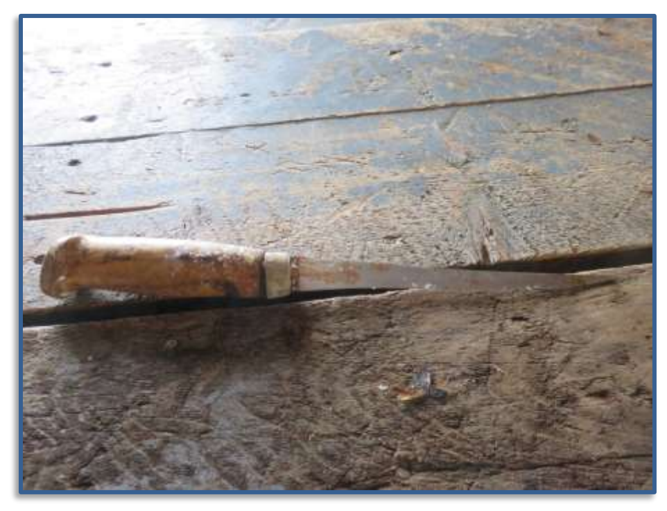
The cutthroater's knife