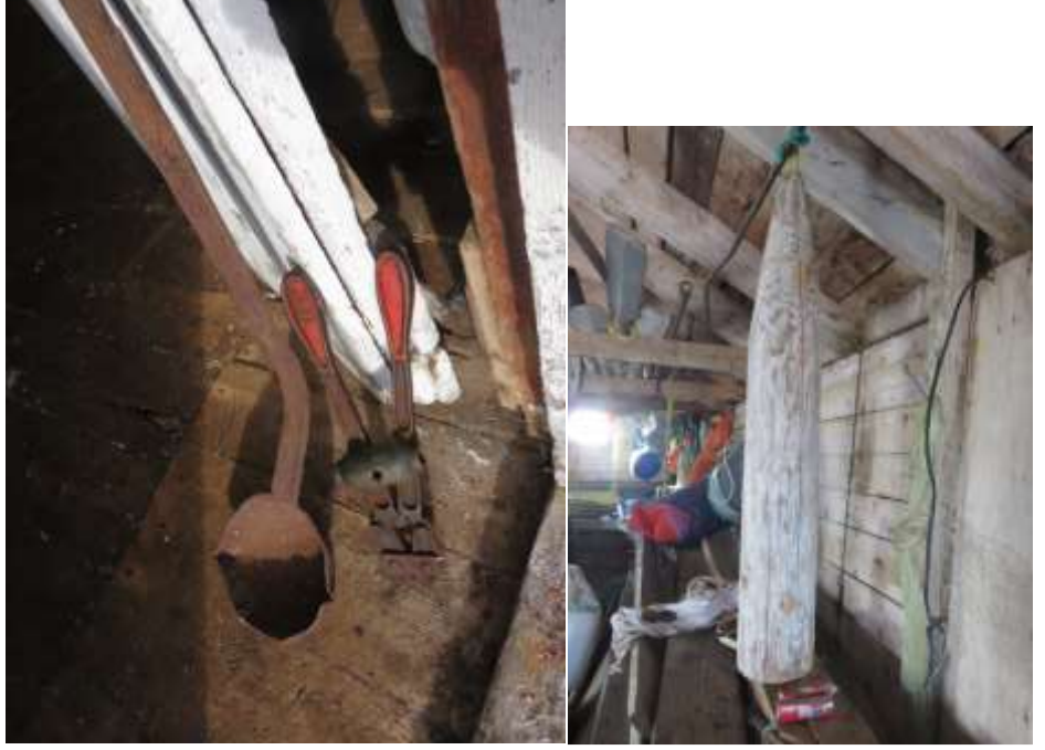
Looking down on a ladle and mold used for making lead balls for a trap (left). And (right) a watch buoy used on the end of a grapelin.