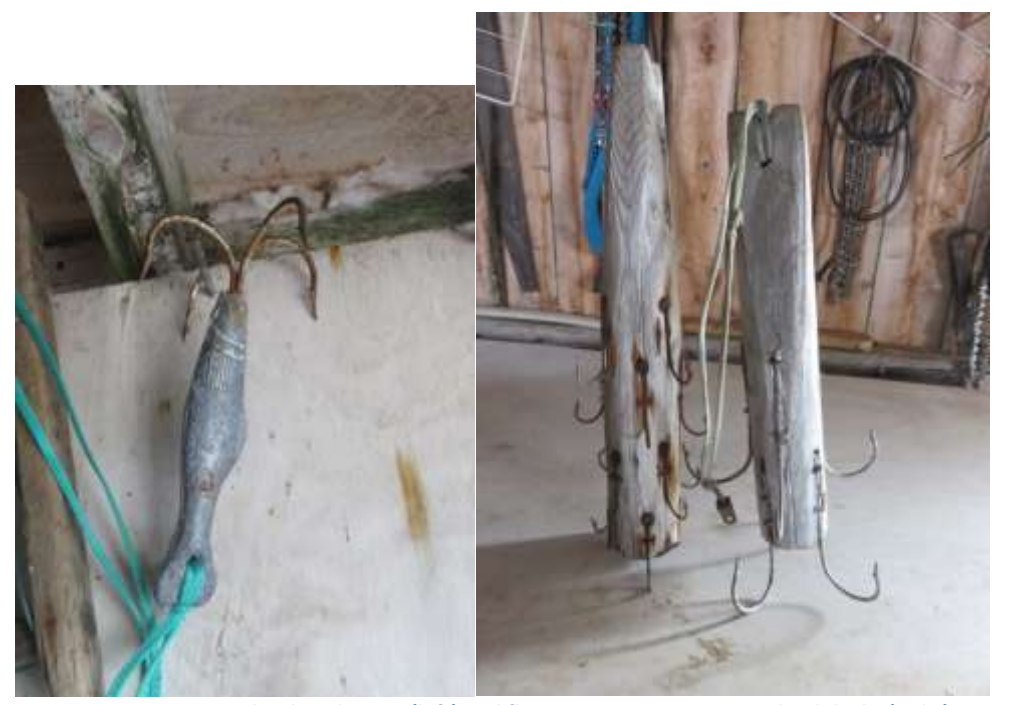
A 4-hook cod jigger (left) and floating jiggers to retrieve dead ducks (right)