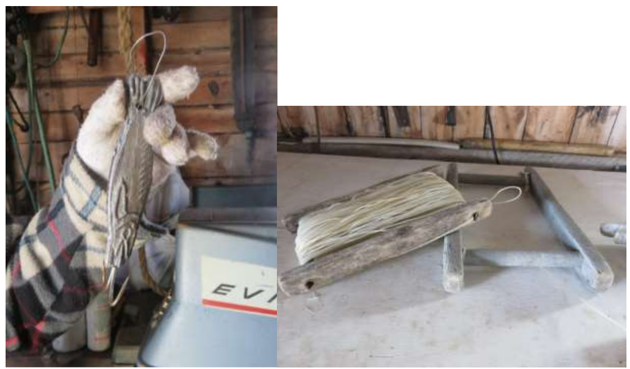
A jigger made from a wooden mold (left) and a jigger reel (right)