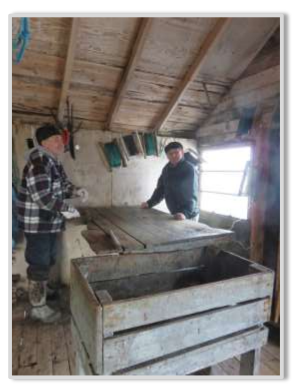
A fish box in front of the splitting table: a young boy would usually place the fish in the box and the cutthroater would begin the process of splitting the fish.