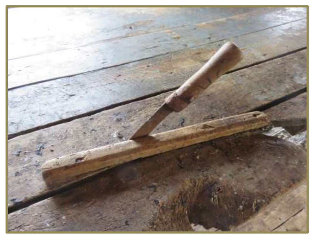
A splitting knife: the man who split the fish usually wore a glove to protect his hand from the sharp blade.