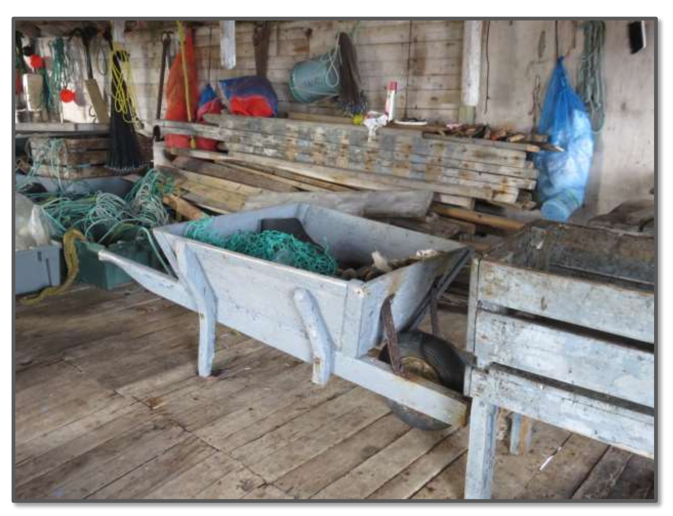
The wheelbarrow was constructed to hold a quintal of split fish.