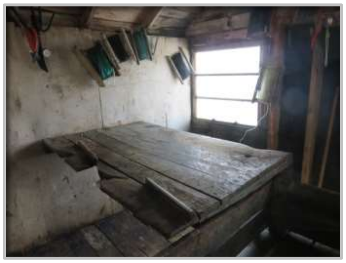
This rustic splitting table in Winston Colbourne's stage was once a hub of activity in a thriving fishery