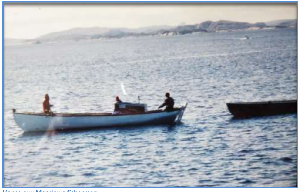
L'anse aux Meadows fishermen

"It was like the dawning of civilization; because the old system had been pure hell."