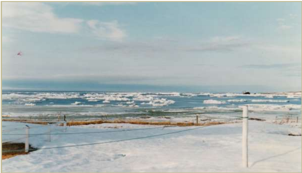
Big Brook coastline in winter