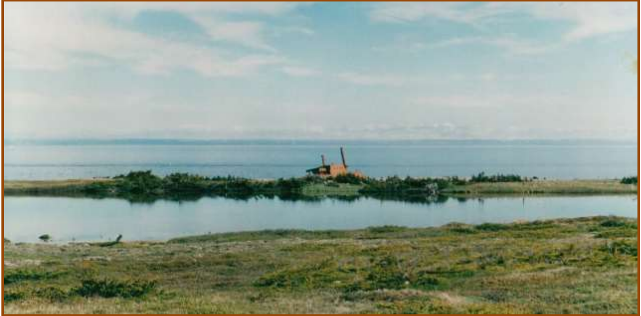
The wreck of the Empire Energy