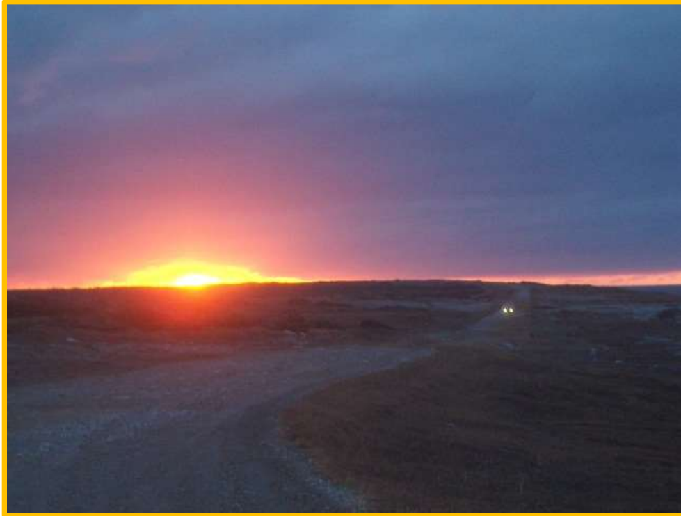
Sunset at Big Brook