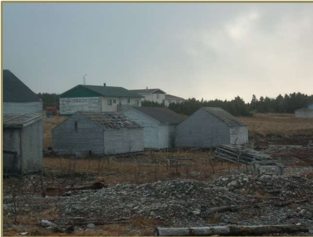
Relics of Resettlement