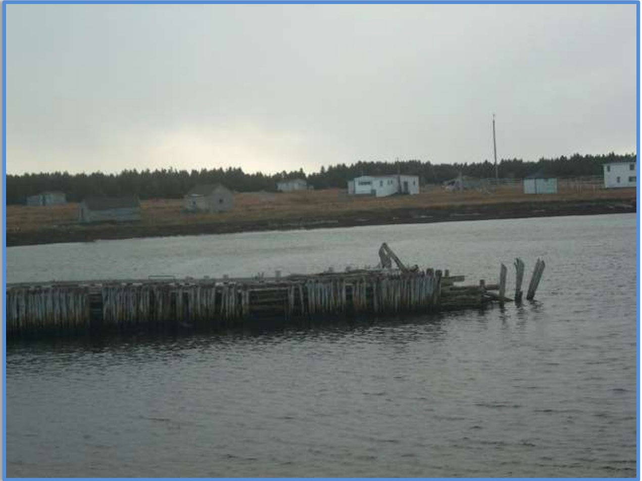
A skeletal wharf falling into ruin