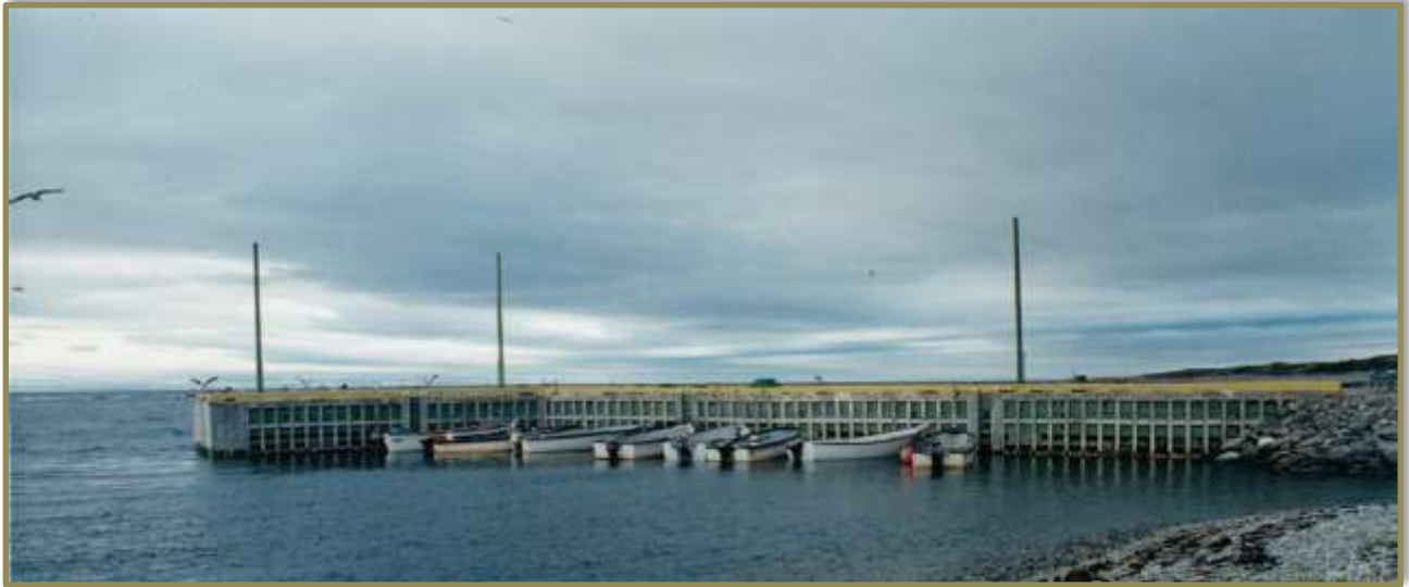
The wharf at Big Brook