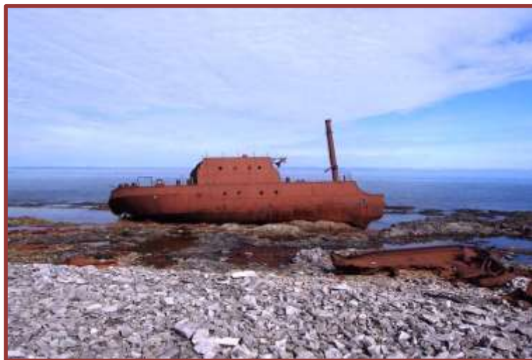
The SS Empire Energy ran aground at Big Brook in November 1941

Empire Energy was a 6,548 GRT cargo ship that was built in 1923 in Germany. She was sold to an Italian firm in 1932 and renamed Gabbiano. She was seized by the United Kingdom in 1940, passed to the Ministry of War Transport and renamed Empire Energy. She served until 5 November 1941 when she ran aground off Cape Norman,