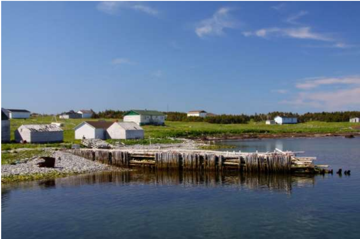
Photo of Big Brook by Jean Bouchard ( http://www.panoramio.com/photo/37818303 )

Noah Diamond was born at Big Brook in 1944, one of 15 children. Noah remembers a small school in the community but the nearest merchant was at Cook's Harbour some 30 kilometers away. Fishermen sold their catch to the merchant, or a schooner sailed into Big Brook in the fall and bought their fish.