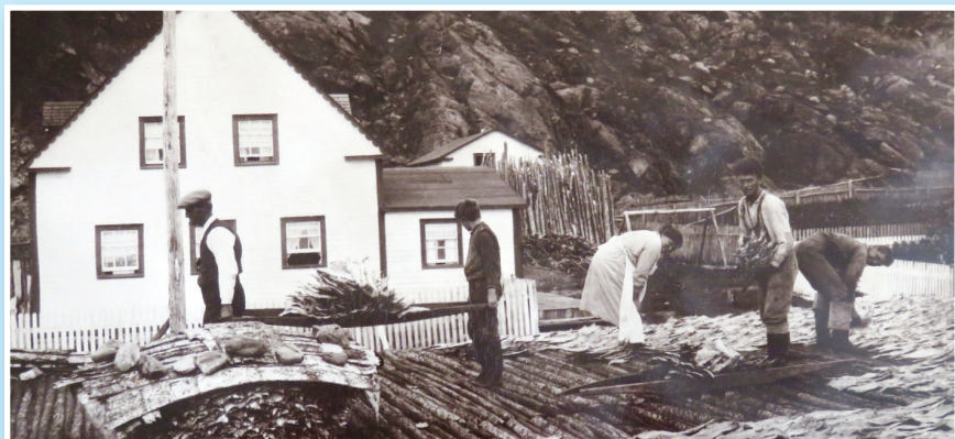
Spreading Fish at Ireland Bight, 1929