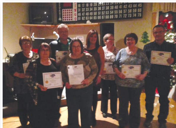
Employees accepting 10 and 15 year service awards

We continue to implement new processing technology that will help reduce cost and improve quality. In 2015, St. An-