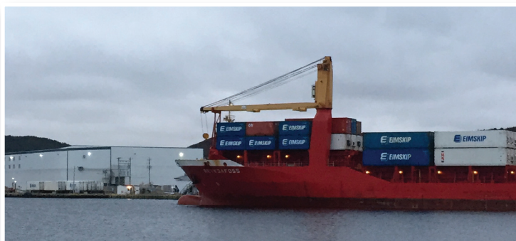
Eimskip vessel – Reykjavoss preparing to dock in the port of St. Anthony this past year.

St. Anthony Cold Storage (Eimskip) Inc. in its first year of operation seen an increase in the number of port calls. For 2015, there was a reported thirty five port calls which include Eimskip vessels, offshore trawlers and some smaller vessels. Inshore volumes decreased in the year. This decrease can be directly linked to lower pelagic volumes compared to years previous. The local economy benefits for the year include over 40,000 man hours directly at the operation and in combination with spinoffs from the port.