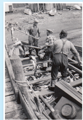
Pronging fish at Ireland Bight

These will be preserved in a digital format and published on the SABRI website. www.sabrinl.com Look for the 2015 project under the Oral History banner.