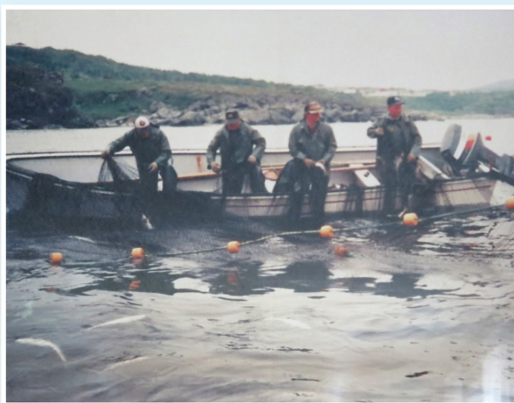
Trap Fishermen Back of the Land at St. Anthony Bight