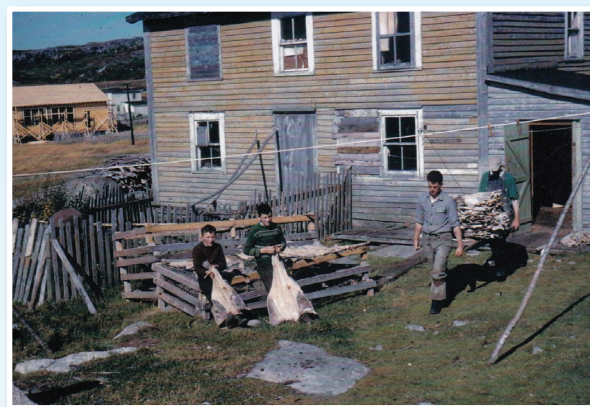
Carrying salt fish on a hand bar, St. Anthony Bight