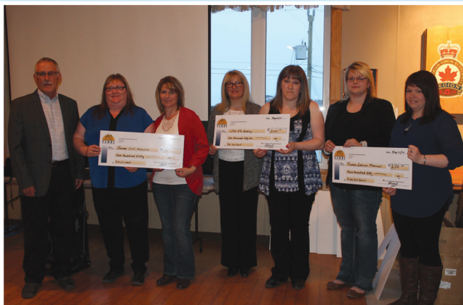
Kids Eat Smart Donations