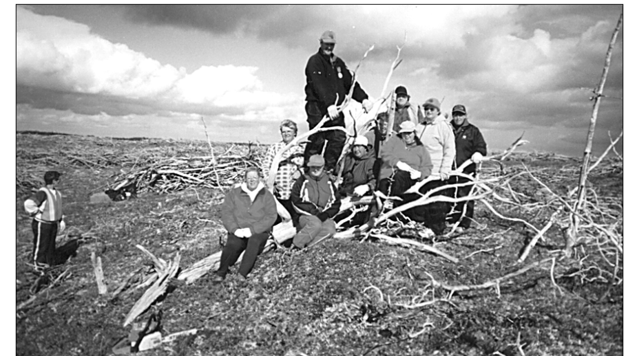
Workers employed on a partridgeberry clearing project near St. Anthony Airport.

Currently SABRI is administering three more ACOA projects. Great Brehat has received funding to repair the community wharf and to renovate their community hall. Nine people are employed for 14 weeks each. St. Carol's has received funding to repair damage to a walking trail and to renovate their community hall. Eight people are employed for a total of 14 weeks each. The other project takes in 4 communities, Wild Bight, North Boat Harbour, St. Anthony Bight and Great Brehat. This involves constructing walking and hiking trails, rests areas, camping areas, etc. in those communities so tourists will be encouraged to make their stay a little