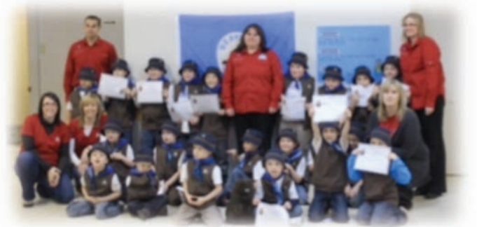
3rd St. Anthony Beavers