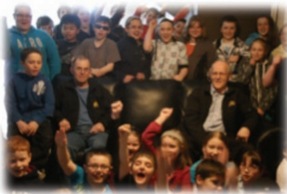
Donation of sofa to Boys & Girls Club