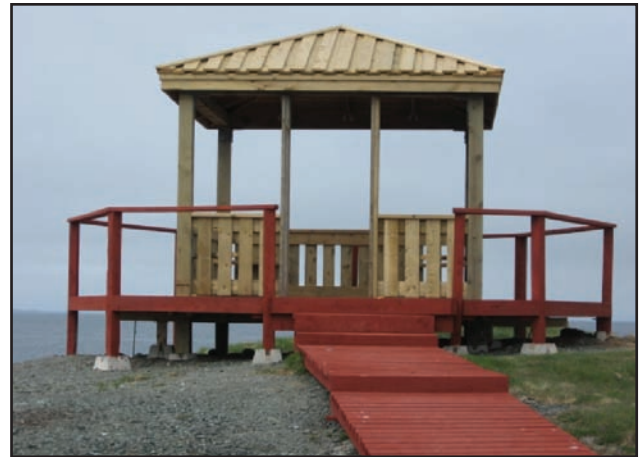
Figure 7 a nice place to 'take a blow' in summer