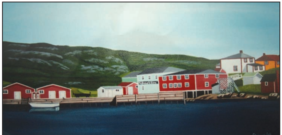
Figure 1 a painting of McDonald & Sons Goose Cove

Grandfather's store was a general store, and you could get everything from a nail to a coal shuttle, and it was the only store in the commu-