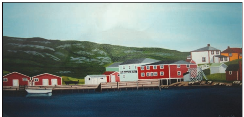
Figure 1 a painting of McDonald & Sons Goose Cove