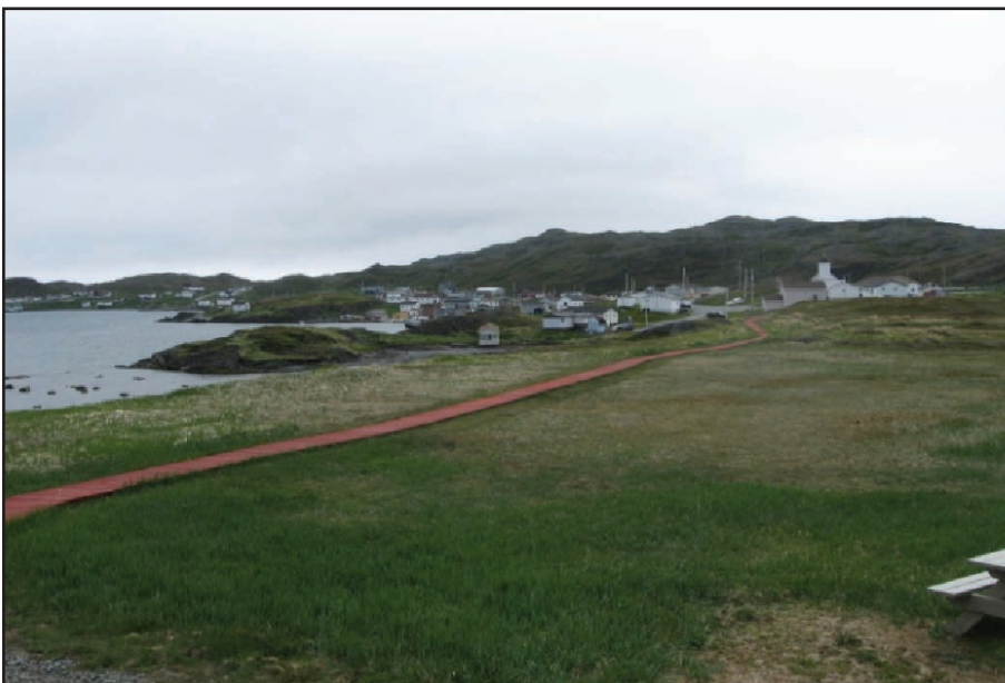
Figure 5 the community of Goose Cove

But nowhere did he so narrowly escape death as he did at his grandfather’s funeral in Conche when he was ten years old. “Boys will be boys,” he says. “There was a bunch of us, down at the wharf fooling around, and a young fellow accidentally set off a 30-30 gun that was in on a splitting table in the stage. The bullet came out through the end of the stage just as I was bending over to untie a boat, and it passed through my hair. That was a very close call! If that were today, somebody would be in a lot of trouble, but back then there wasn’t much importance attached to it. Of course, if I’d been killed, well, that would have been another story!