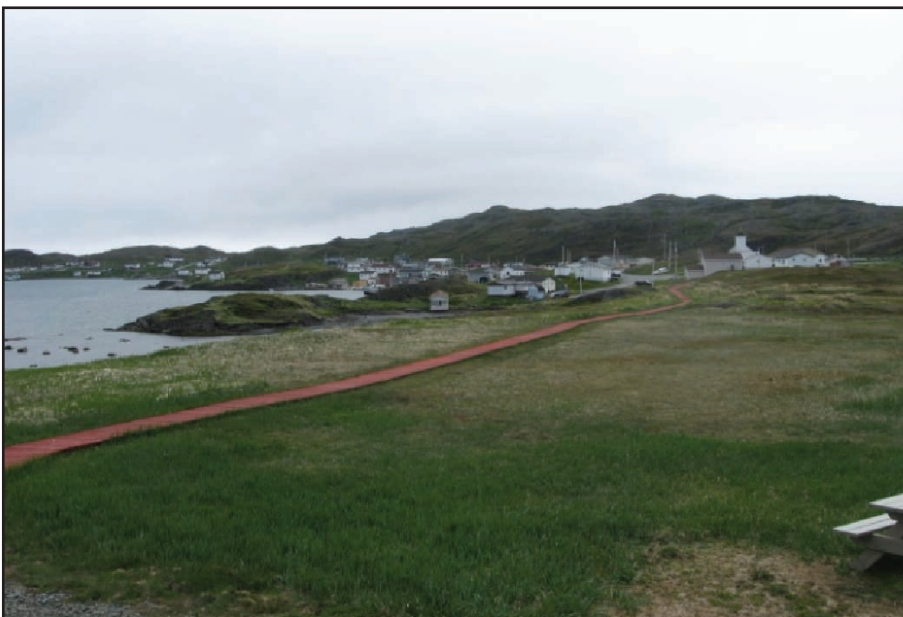
Figure 5 the community of Goose Cove

But nowhere did he so narrowly escape death as he did at his grandfather’s funeral in Conche when he was ten years old. “Boys will be boys,” he says. “There was a bunch of us, down at the wharf fooling around, and a young fellow accidentally set off a 30-30 gun that was in on a splitting table in the stage. The bullet came out through the end of the stage just as I was bending over to untie a boat, and it passed through my hair. That was a very close call! If that were today, somebody would be in a lot of trouble, but back then there wasn’t much importance attached to it. Of course, if I’d been killed, well, that would have been another story!