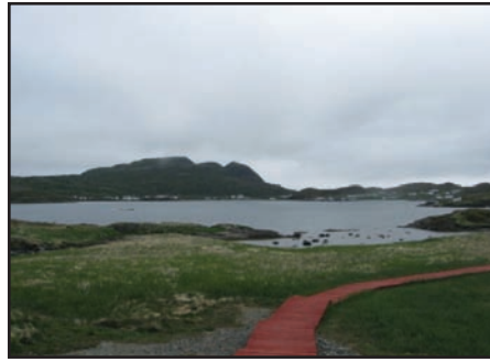
Figure 2 the community of Goose Cove from the boardwalk 2009

I remember growing up, Goose Cove was always a lively place; there was a good atmosphere. There were eleven of us in our family, eight in my uncle's next door; there were three Reardon families, and every one of them had eight children. One family had no more