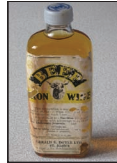
Figure 4 Beef Iron Wine was a popular remedy for anaemia

We randied together, we skated together, and we had football games together, and it wasn't just the men that played football, either; the girls did, too. As kids growing up, we all played football. We played together, we lived together, and we studied together. There were two sides to the harbour; the Protestant side and the Catholic side; we played with the Protestants, we played with the Catholics, and we buried each other's dead. We supported each other; lots of times football games would be one side