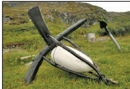
Figure 3 Killicks are a relic of the past

than another. Our family, because of the business, were considered to be well-to-do, but we never knew that growing up. I never had any more than the girl next door. When I grew up I had three outfits: one for Sunday, one for this week, and one for next week, and I traded them around. We just didn't care who had what.