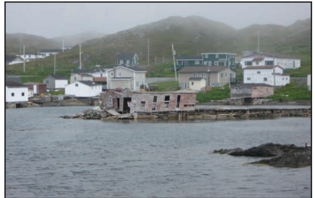
Figure 6 a snapshot of Goose Cove on a grey foggy day 2009