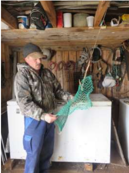
A twine hook (such as this one) was suspended from the ceiling—it was usually carved from wood. This twine hook made the mending of nets an easier job for fishermen.

A common sight in local homes through the winter—when it was time for the nets to be mended—would be reams of netting hanging from the ceiling. When the twine was purchased it was white; fishermen x barked it in the spring.