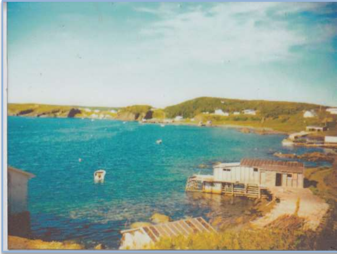
Fishing stages and wharves in Ship Cove Harbour