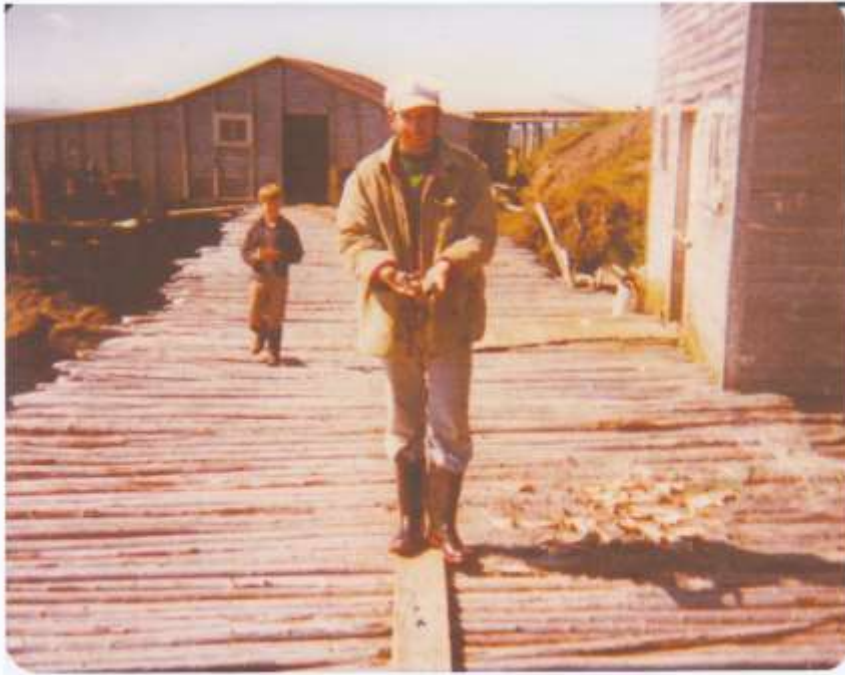
A couple of young fellows on the Andrews’ flakes