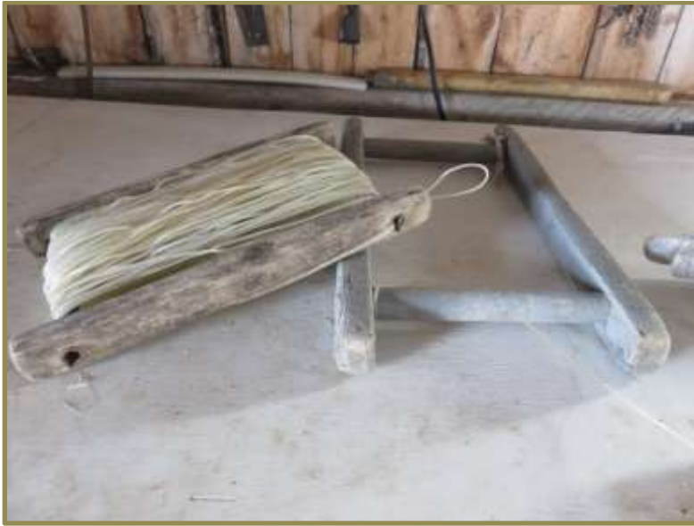
A jigger reel

As well as two cod traps, the crew managed two capelin traps. Capelin, which, in the old days had been used for bait, dog feed, or to fertilize the gardens, was no longer caught using a cast net from the shore; now it had become a commercial enterprise and was sold internationally. With the capelin traps, “you could haul enough capelin for a lifetime, old man,” remembers Gus.