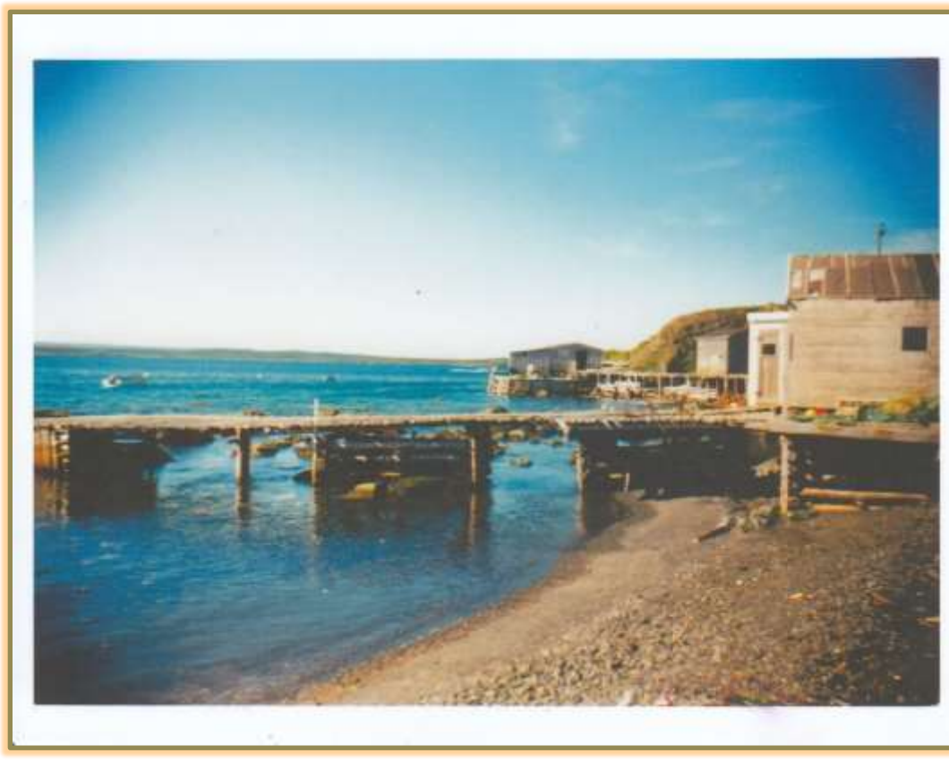
Deckers wharves and stages (forefront)