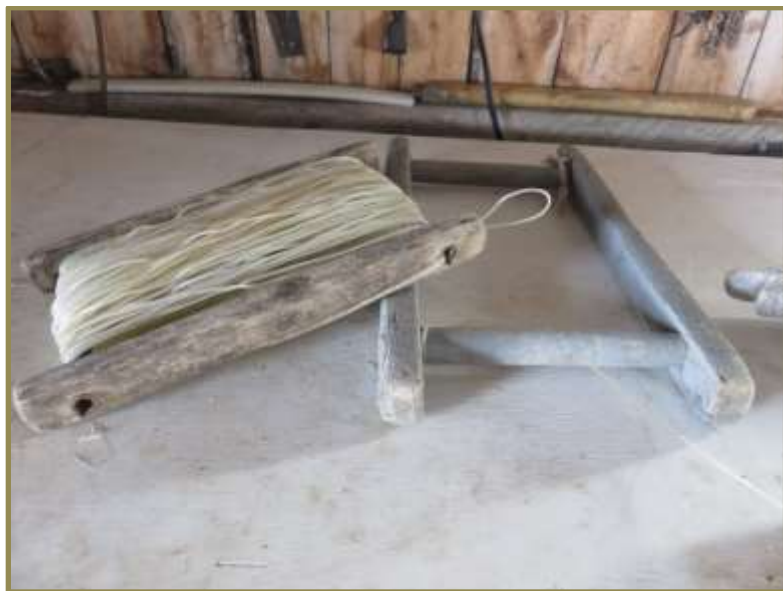
A jigger reel

As well as two cod traps, the crew managed two capelin traps. Capelin, which, in the old days had been used for bait, dog feed, or to fertilize the gardens, was no longer caught using a cast net from the shore; now it had become a commercial enterprise and was sold internationally. With the capelin traps, “you could haul enough capelin for a lifetime, old man,” remembers Gus.