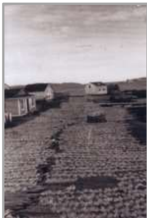
Fish drying on flakes at the Decker Premises in Ship Cove

There was a first draw (for the best berths) and a second draw for the second berths. The Gold Pot and The Onion were the most coveted berths.