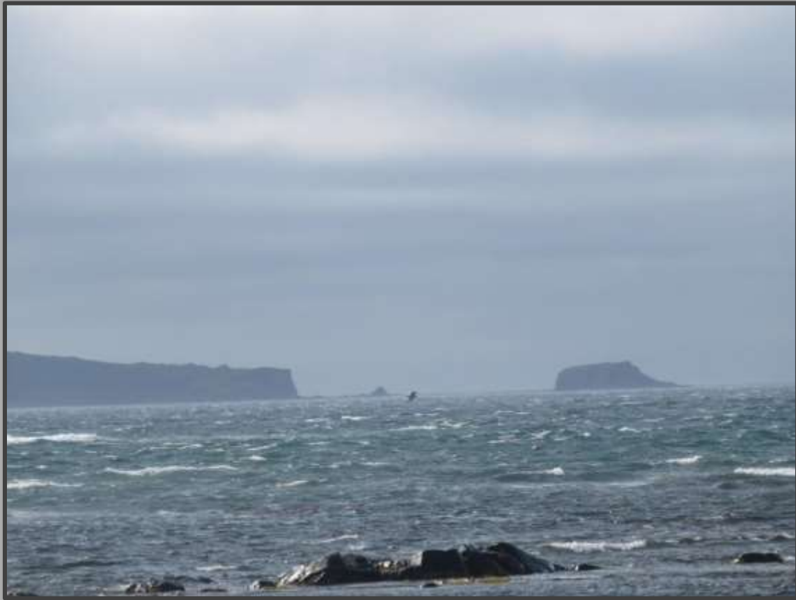
Looking across to Cape Onion from L'anse aux Meadows