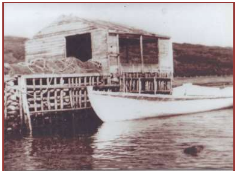
A trap skiff at the wharf