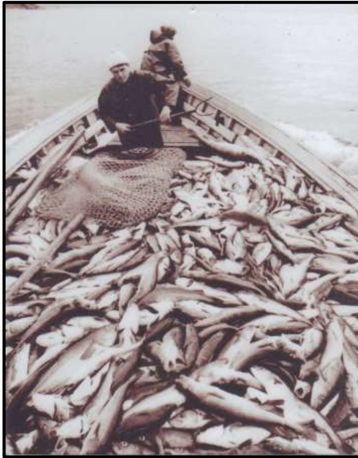
Returning with a load of fish

a good cutthroat could keep two splitters going. The splitter's job was to take out the soundbone, and the splitter wore a glove on one hand. After the soundbone was removed, the fish was then washed in a vat (pronounced 'vate'), which was a wooden bathtub full of sea water. Once washed, the fish was then taken in a wheelbarrow to the shed, where it was salted. Elizabeth Tucker (Selby's mother) didn't wear gloves to salt the fish; she used a saucer to sprinkle the salt over the fish; Delilah used her bare hands. A prime fish didn't have a peck on it. There were two types of salted fish: v shore fish and vi Labrador, and, according to Delilah, you could never put too much salt on Labrador fish.