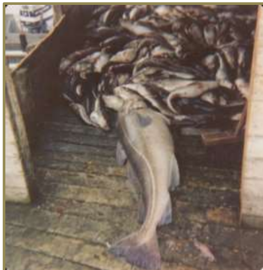
Codfish in the store