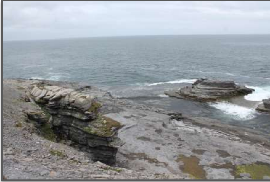
The spectacular geology of the land, and far-reaching seas of Boat Harbour, makes it an awe-inspiring place to visit.

“North Boat Harbour had good beaches for drying fish, for drying nets, for anything that needed drying,” remembers Enos. “But the disadvantage to spreading fish on the beach was the gulls!”