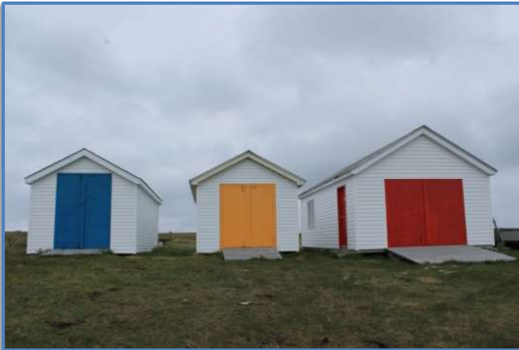
Modern, colorful sheds at Boat Harbour.

There was no quota in those days; fishermen put their traps out in June and fished as long as they could, usually until November. And, if the fish were running, then traps were put wherever fishermen hoped to make a catch.