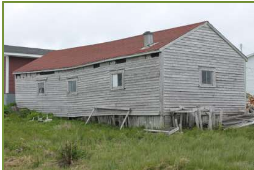
Old fishing stores and shed can be seen around North Boat Harbour.

“Almost every year the wharves would wash away, and what the waves didn’t damage the vi ballicatters did. When there was a northeast wind the seas were heavy,” remarks Enos.