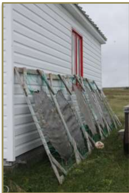
A tradition of stretching seal pelts is still carried on today