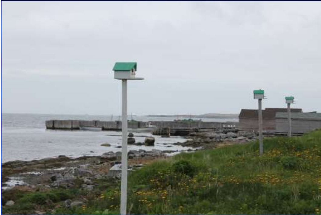
Decaying wharves at North Boat Harbour.