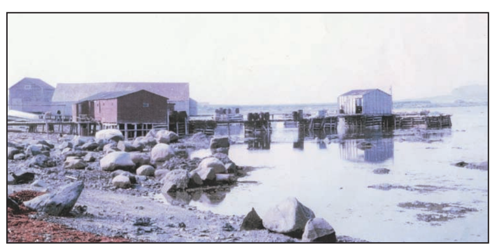
Figure 1 L'Anse aux Meadows Point.

Not only that, there was no such thing as oil clothes, or rubber clothes for fishing. Mother used to make them with old Cream of the West flour bags or Robin Hood bags. And she'd make them nice, eh? Oh, they were right beautiful! Then she'd spoil them with linseed oil. Linseed