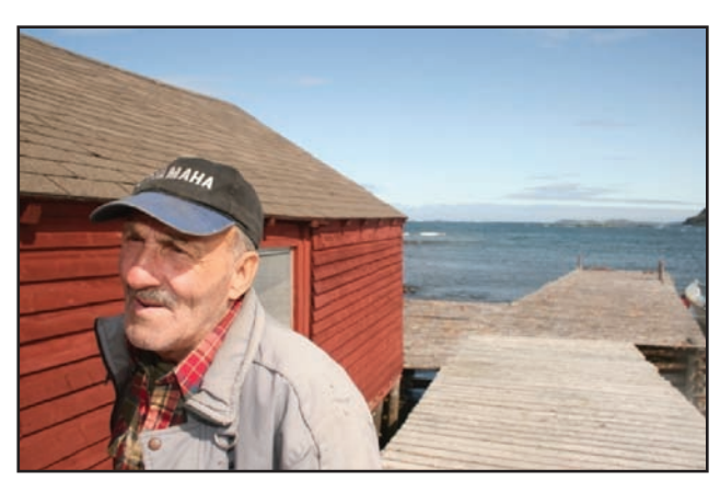
Figure 3 On the wharf