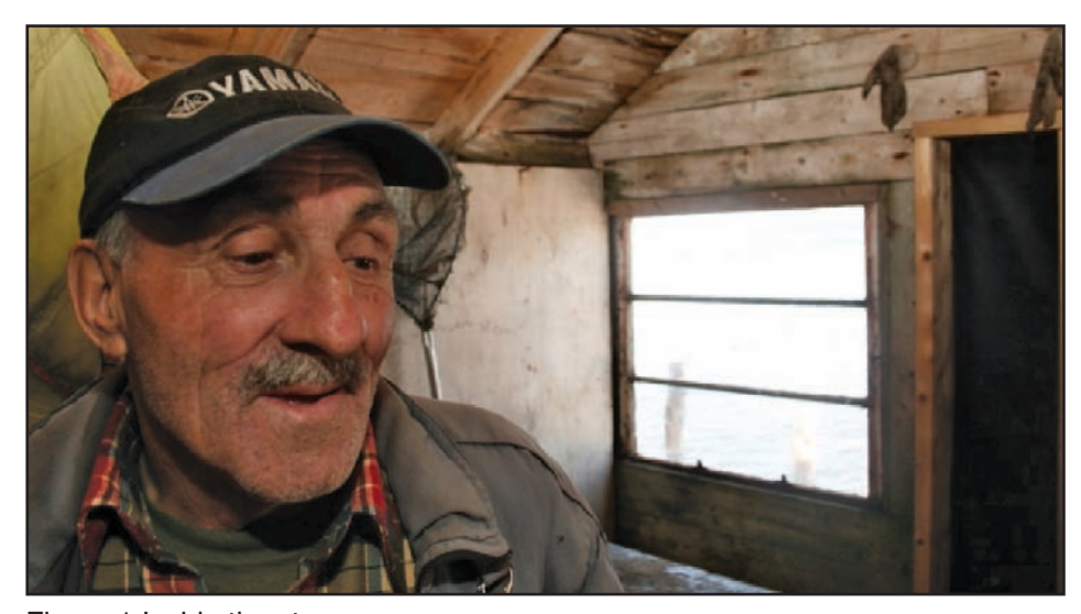
Figure 1 Inside the stage

I figured it was time for things to change; time for my mother not to be doing a man's work. She was expecting her eleventh child. My father figured she should be there, splitting fish with us. I was sixteen years old then, and I took her right back to the house and told her not to be at that again. My father was angry, and