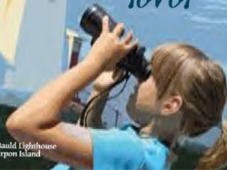
Cape Bauld Lighthouse on Quirpon Island