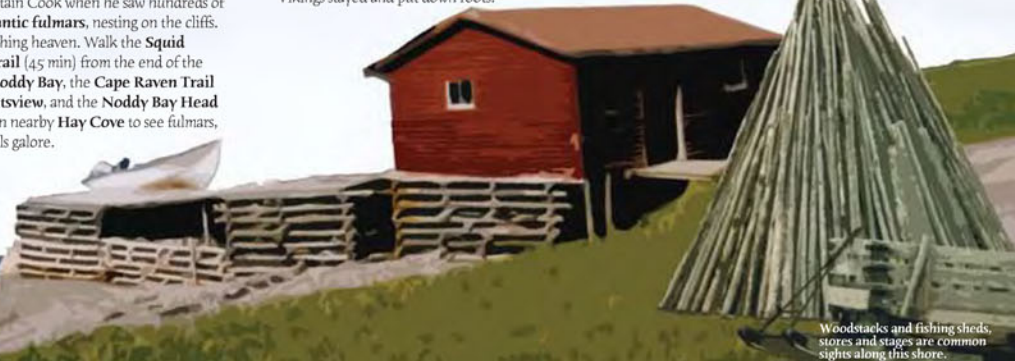
Woodstacks and fishing sheds, stores and stages are common sights along this shore.

Still up for a walk? Seabirds, a sea cave , and the 1947 wreck of the S.S. Langlecrag can be seen from Lacey's Trail (2 hrs), which starts off the main road to L'Anse aux Meadows . At L'Anse aux Meadows National Historic Site of Canada , a UNESCO World Heritage Site, the story of the Norse who came here around 1000 A.D. comes alive. Nearby, Norstead: A Viking Port of Trade , is an imaginative recreation of life as it might have been had the Vikings stayed and put down roots.