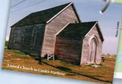
United Church in Cook's Harbour