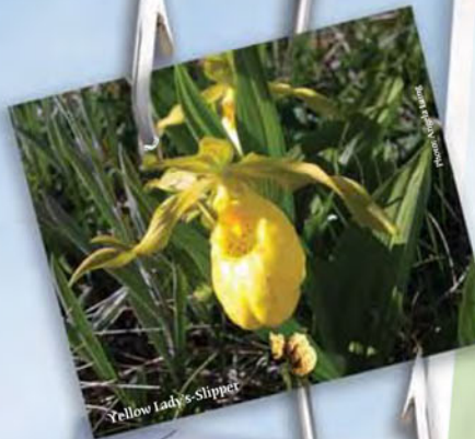
Yellow Lady's Slipper